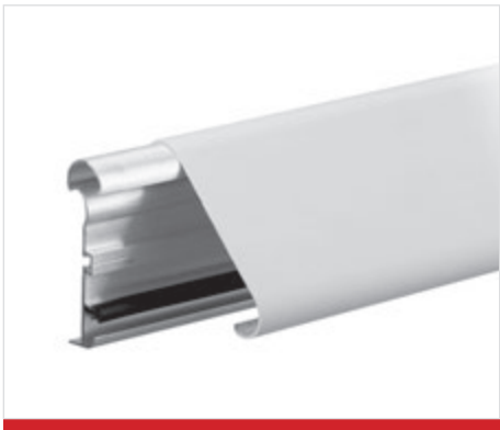
Standard length 4 m