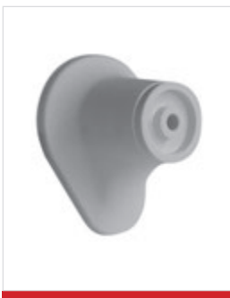
Acrovyn® mounting bracket