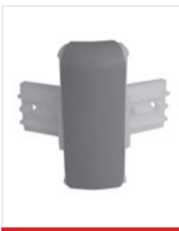
Special external corner Please consult