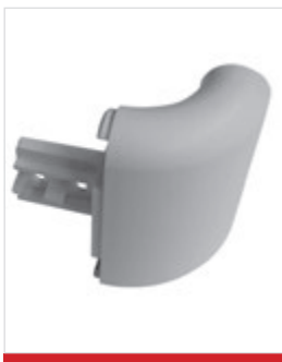
Standard end cap